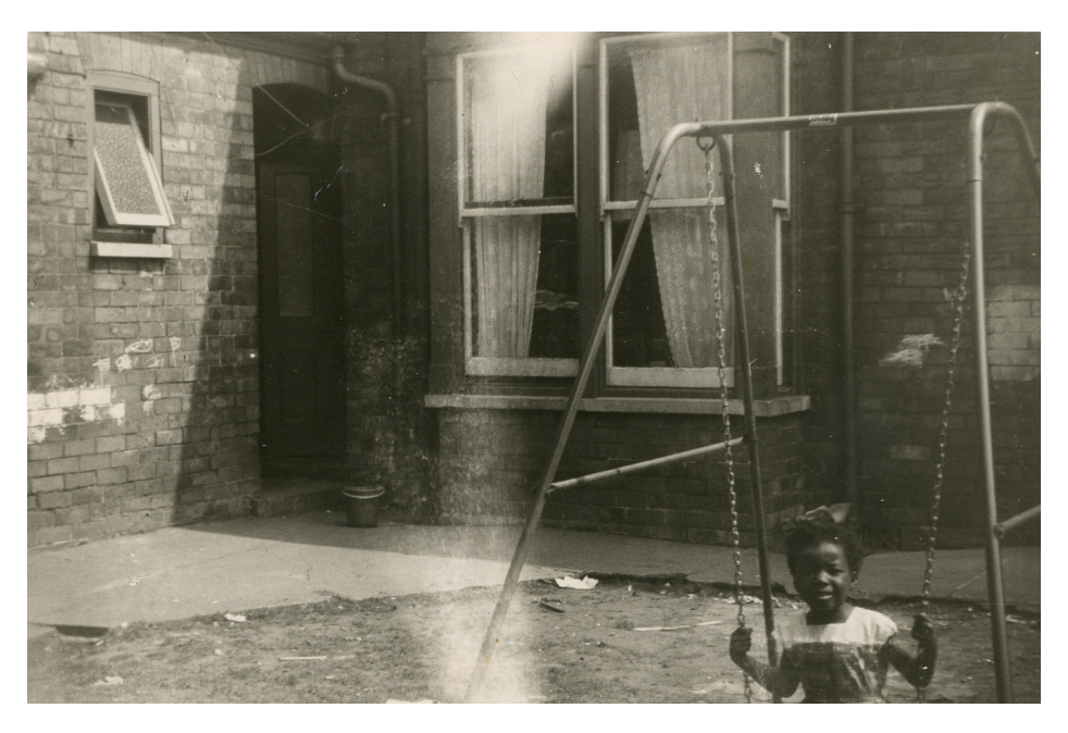
Playing in the Gascoine Estate, Barking, c. 1960, collected during our 'Open Estate' project