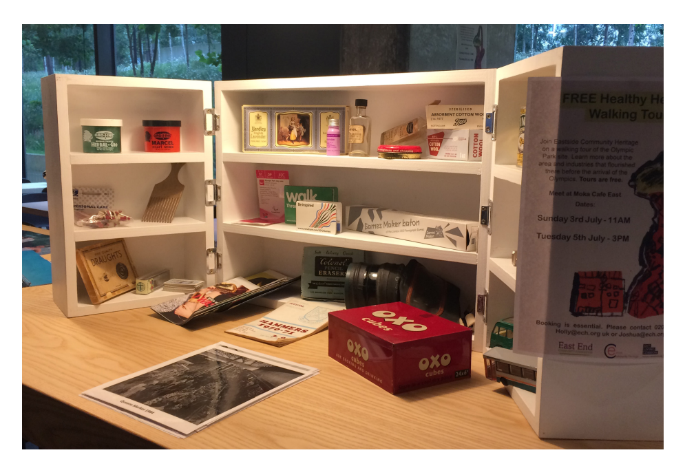
Some of the exhibits in Eastside's 'Museum on Wheels'