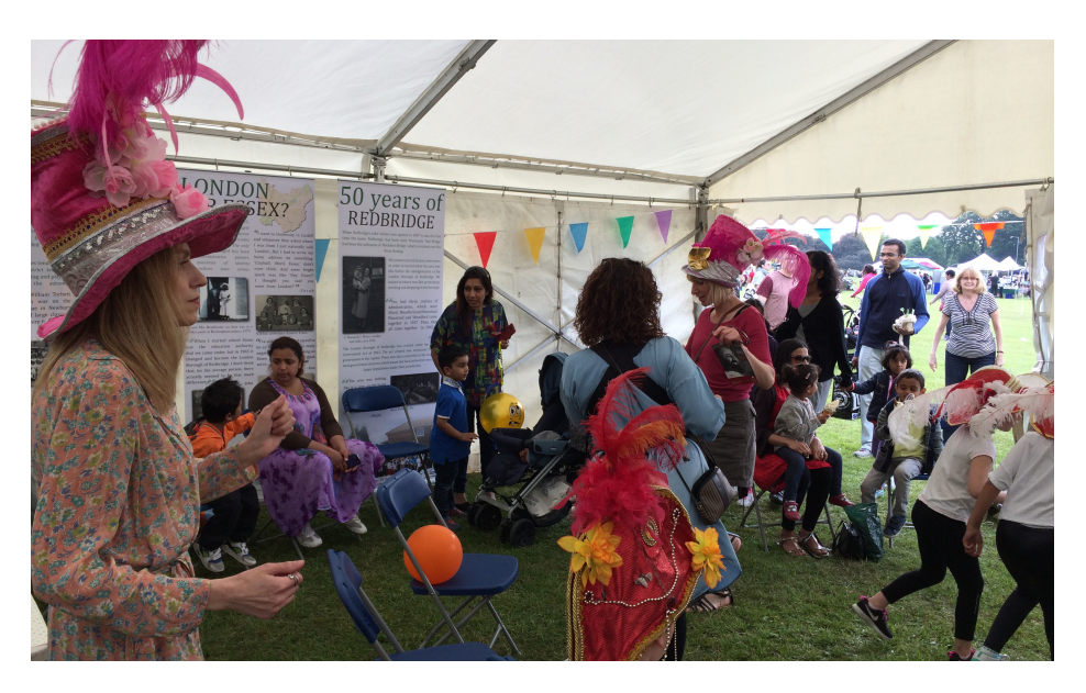
... and at a tea dance session at Redbridge Green Fair