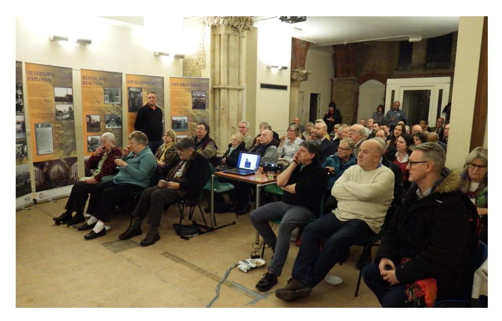
Eastside's exhibitions out and about: at a historical talk in Silvertown...