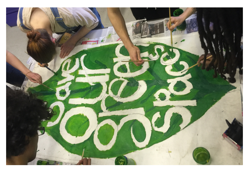
Young people from the Woodcraft Folk engaging with arts and heritage learning