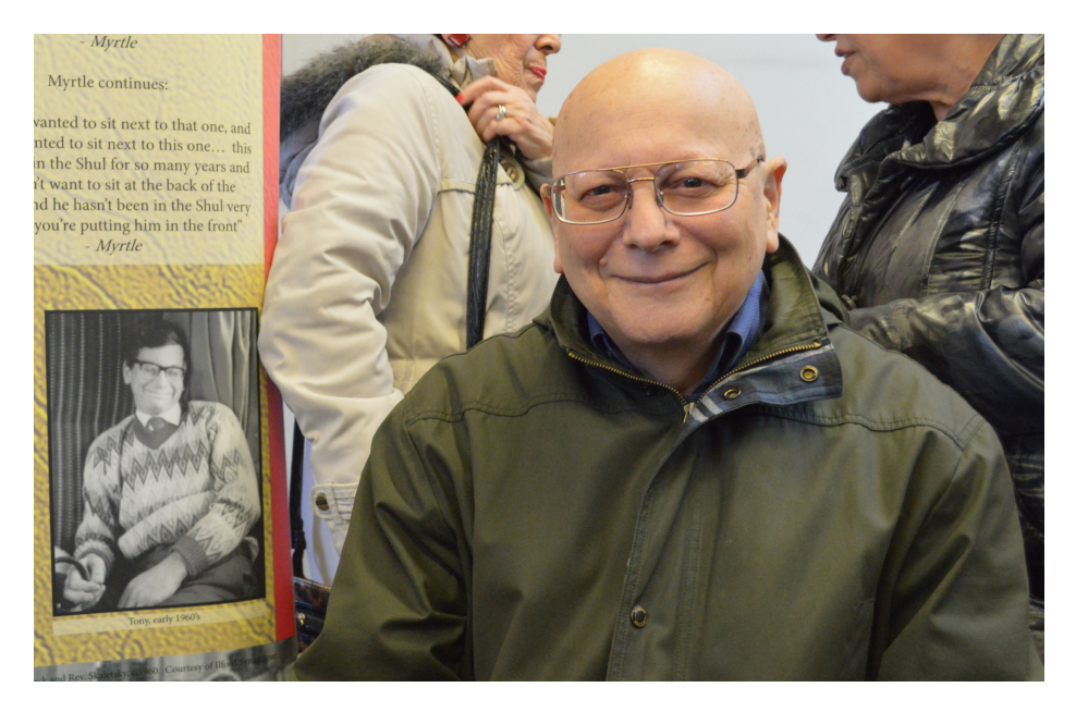
A project participant finds his picture in our 'Cinema to Synagogue' exhibition