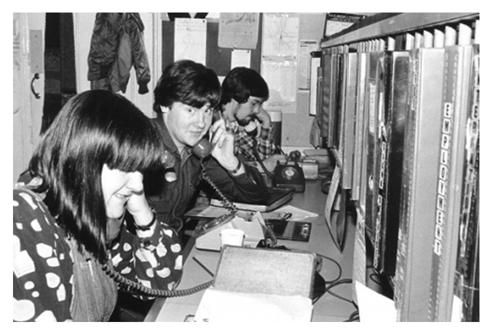
Volunteers at the LGBT Switchboard, gathered in our '30 Years of living with HIV' project